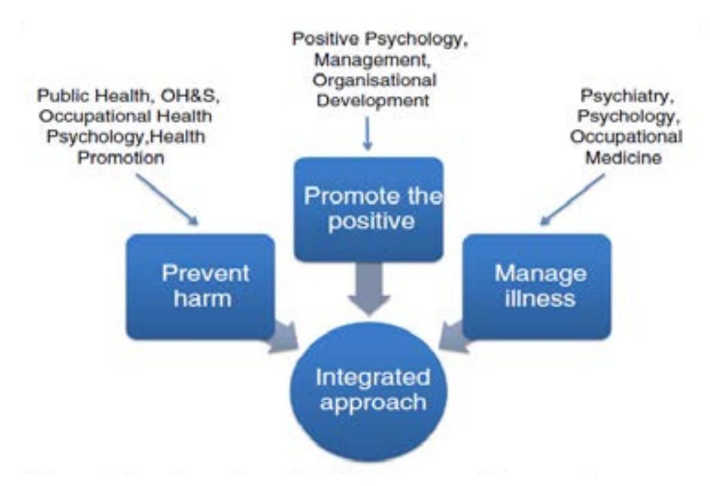
Figure 2: The three threads of the integrated approach to workplace mental health

Over the past few years the disconnection between the evidence of the risk factors for workplace mental ill-health, and the approaches to reducing mental ill-health and promoting psychological wellbeing in the workplace has become more evident. In general, interventions have been focussed on individual employees either managing their stressors and becoming more mentally literate, and manager training. The current optimal approach involves integrated interventions that operate at different levels of the complex systems that are organisations taking into account their context. La Montagne et al. proposed a three pronged approach that systematically integrates harm prevention by reducing work related risks to mental health, promoting the positive aspects of work and organisations, and responding effectively to mental ill-health (LaMontagne, Martin et al. 2014).