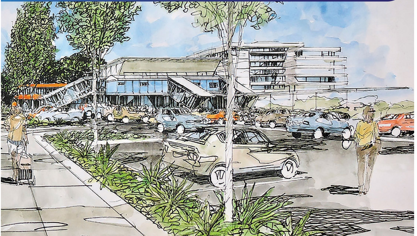
Indicative artist's impression of the proposed West Ryde commuter car park, subject to detailed design.