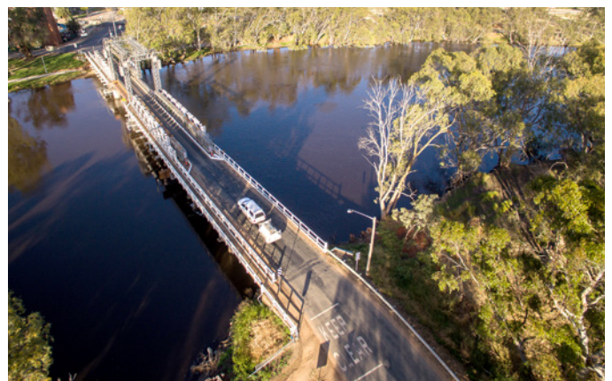
The existing Swan Hill Bridge