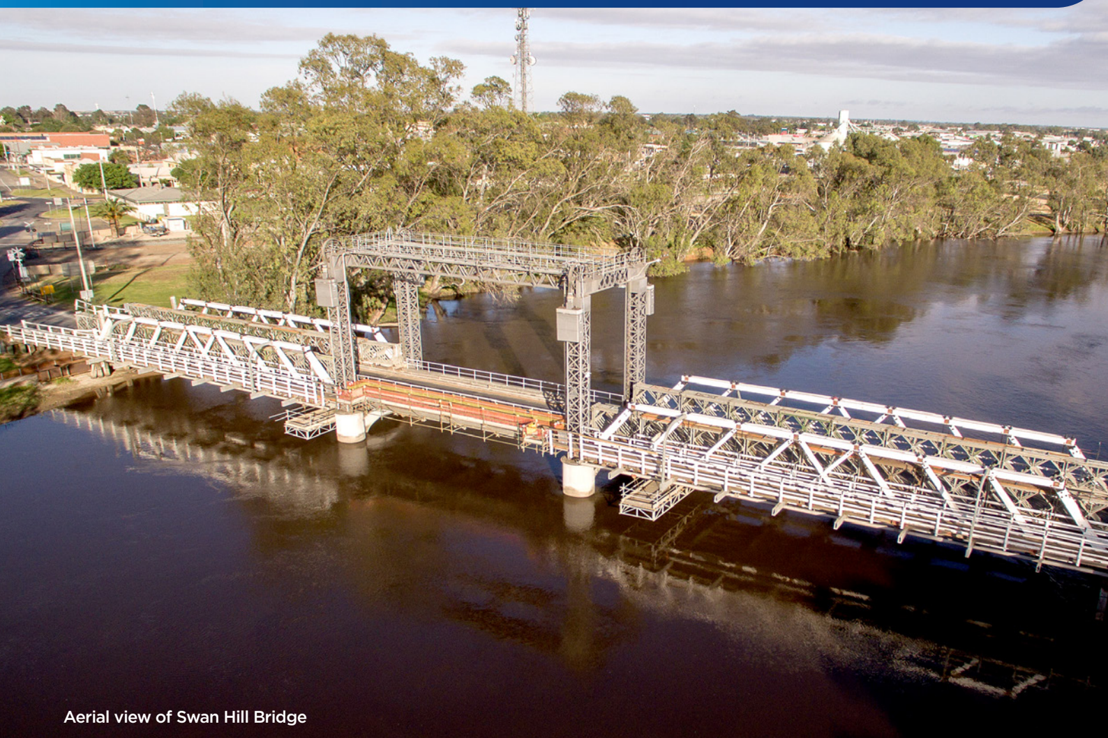
Aerial view of Swan Hill Bridge