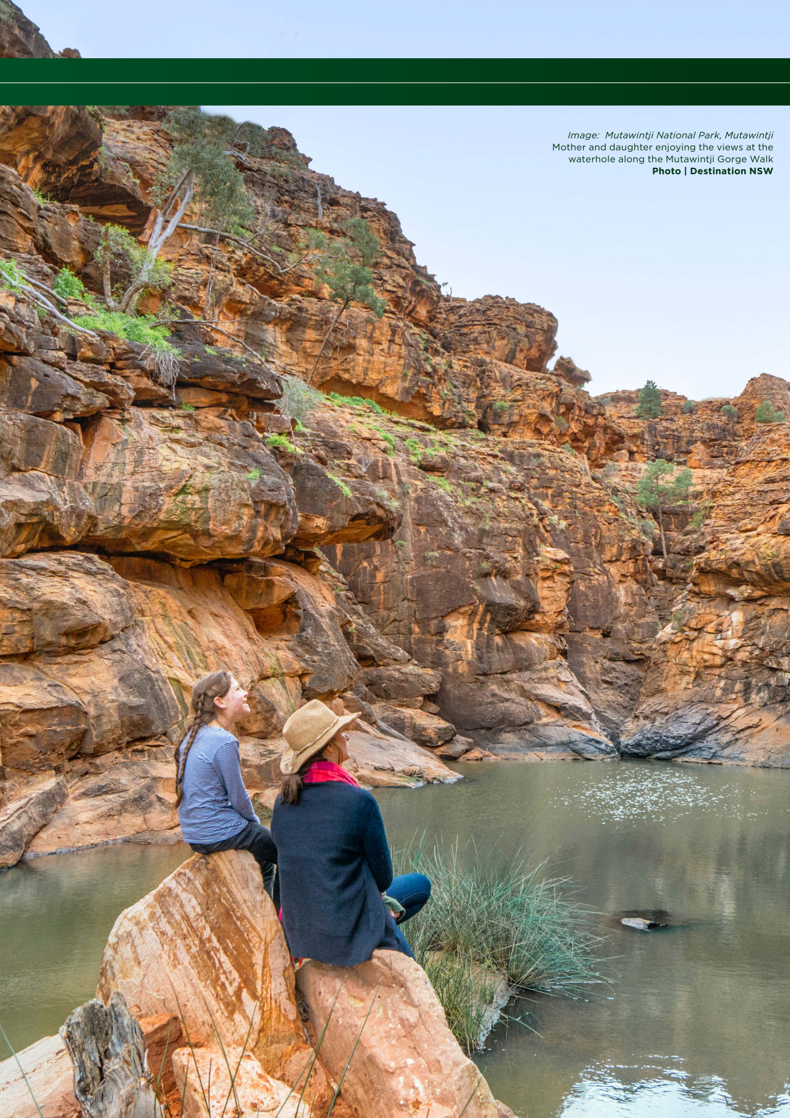
Image: Mutawintji National Park, Mutawintji Mother and daughter enjoying the views at the waterhole along the Mutawintji Gorge Walk