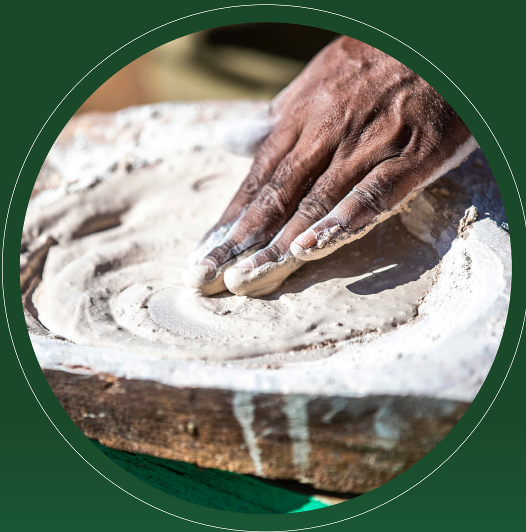
Image: Cultural knowledge being shared by a Bourke Aboriginal Tours guide