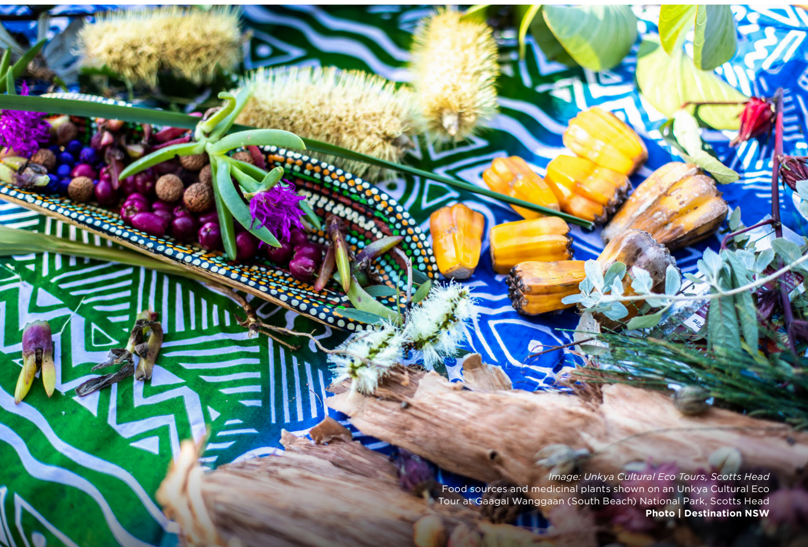
Image: Unkya Cultural Eco Tours, Scotts Head Food sources and medicinal plants shown on an Unkya Cultural Eco Tour at Gaagal Wanggaan (South Beach) National Park, Scotts Head Photo | Destination NSW

Applicants should submit their completed business case, data sheet and other supporting documents no later than midnight on 19 April 2019.