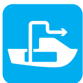
Pump out area