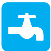
Water wash down