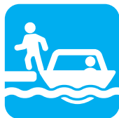
Water Taxi access