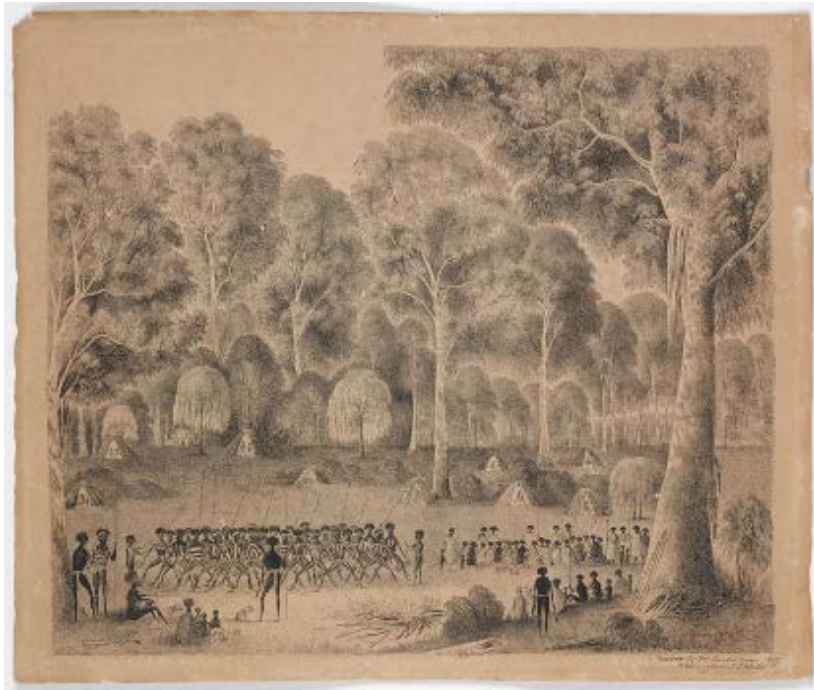
Photo 2 Corroboree, Wellington Valley 1847.

Maynggu Ganai is located in traditional Wiradyuri Country, which covers a large portion of central New South Wales and is known as the land of three rivers: the Wambool , later known as the Macquarie; the Galari , later known as the Lachlan; and the Marrambidya , later known as the Murrumbidgee.