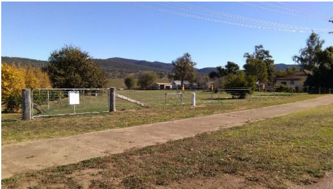
Photo 3 View of Well Block from the Mitchell Highway.

Due to its small size, Maynggu Ganai does not present a significant fire risk. A fire management strategy which defines the fire management approach for the site has been prepared and is updated periodically. The strategy aims to protect the site from fire as far as possible. Growth of ephemeral grasses after wet conditions can substantially increase the available fuel layer; therefore mechanical fuel reduction is undertaken as needed.