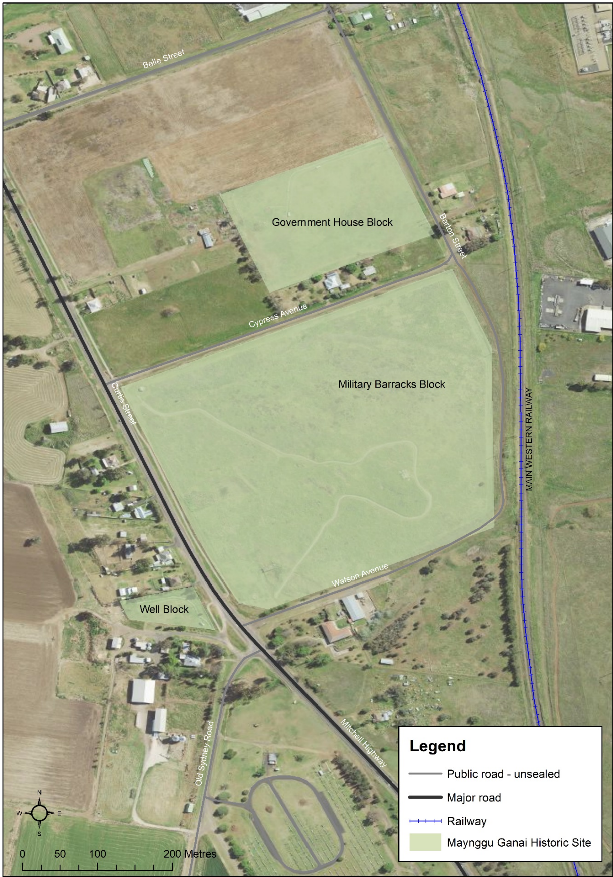
Figure 1 Maynggu Ganai Historic Site.