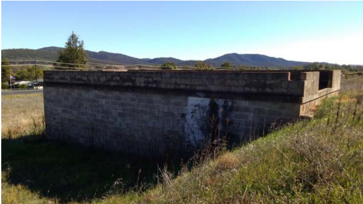
Photo 6 Besser block shed and loading ramp from a former chicken farm on Military Barracks Block.