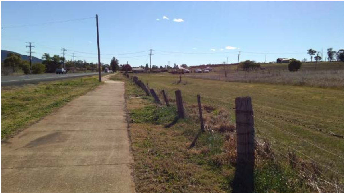
Photo 5 Boundary fencing along the Mitchell Highway frontage, which is proposed to be replaced.

Boundary fencing around the site is in variable repair, with most fencing around Military Barracks Block in a dilapidated condition. NPWS proposes to replace old and ineffective boundary fencing as needed to help define the curtilage of the site and improve its aesthetic appearance, particularly along the Mitchell Highway frontage (see Photo 5).