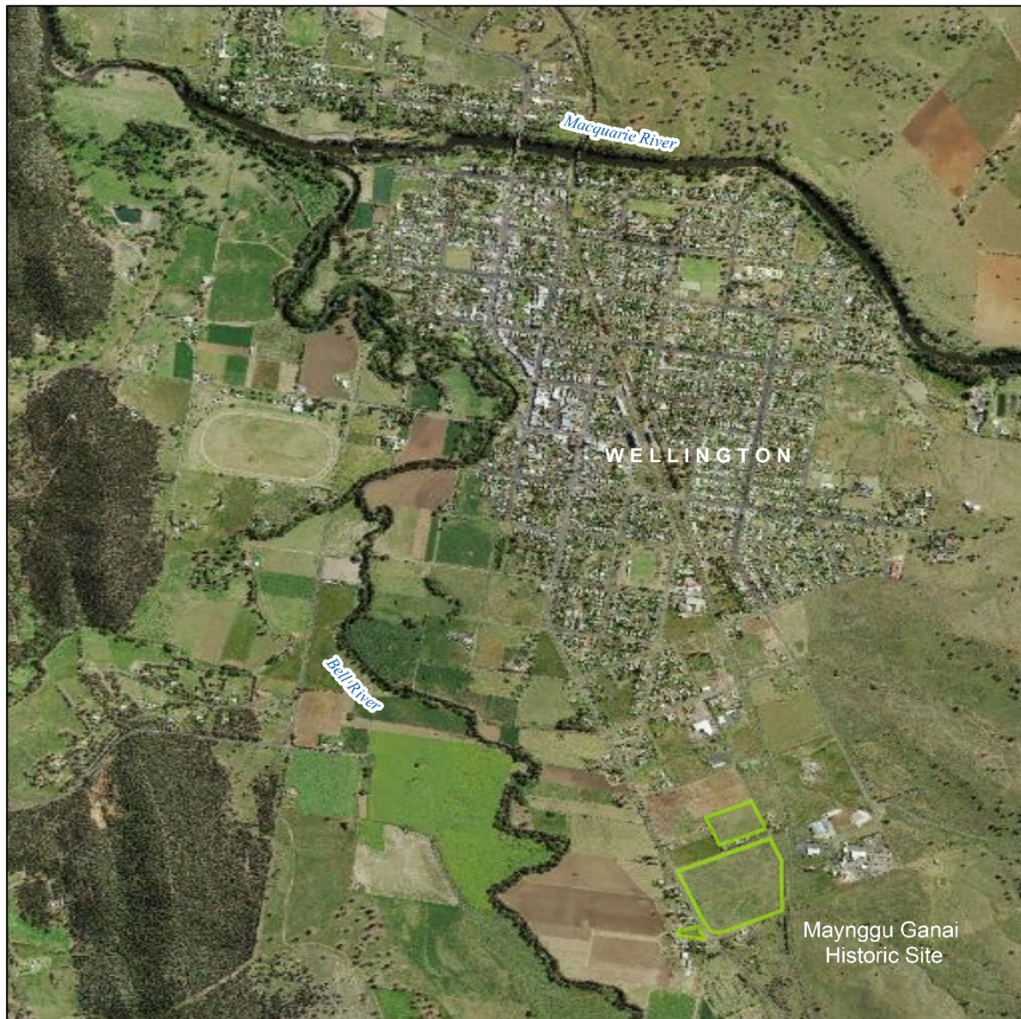
Photo 1 Aerial photo of Wellington showing the location of Maynggu Ganai on the town's southern outskirts.