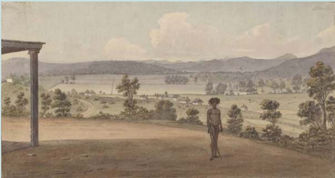
Wellington Valley, looking East, from Government House, Augustus Earle watercolour c. 1826

After only a few years the struggling agricultural settlement was deemed a failure and closed.