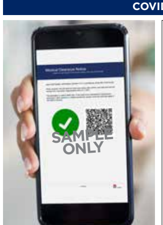
(Shown as a digtal pdf)

People aged 16 or over now need to show proof of COVID-19 vaccination or a signed medical exemption as a condition of entry to most businesses. Here's what's accepted as proof of medical exemption: