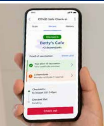
(Shown on the Service NSW app available from 17 October)