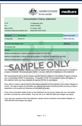
(Shown as colour print)