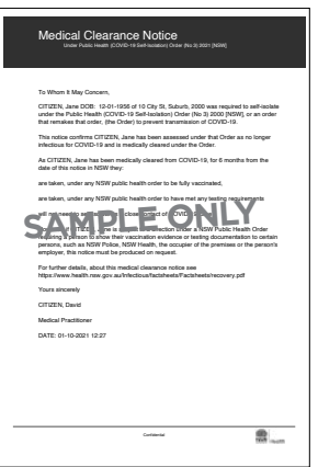
(Shown as black & white print)