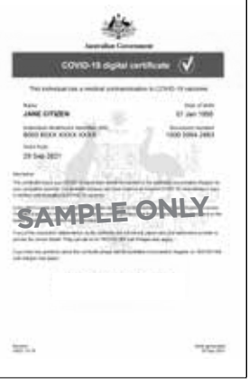
(Shown as black & white print. Must be signed by a doctor)