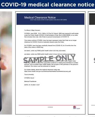
(Shown as colour print)