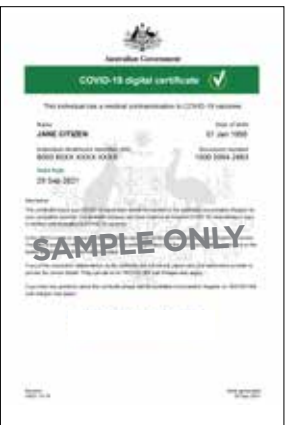
(Shown as colour print. Must be signed by a doctor)