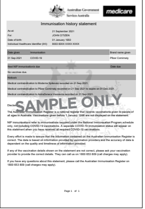
(Shown as black & white print)

You may be fined $1,000 if you don't comply.