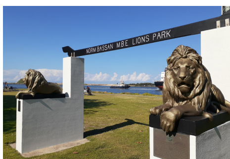
Above: Hunter Business Lions Club Inc. successfully applied for funding under the NPCCF for the restoration of the Norm Bassan MBE Lions Park Monument. Right: Horseshoe Beach - an off-leash dog beach near Macquarie Pier.

Unsuccessful applicants will be notified in writing of the outcome of each application and will be offered a feedback information session.