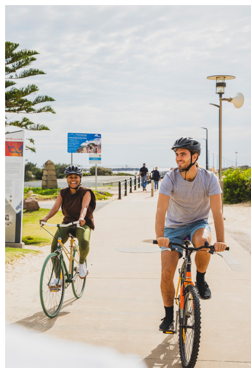
Cycling is popular along Macquarie Pier.