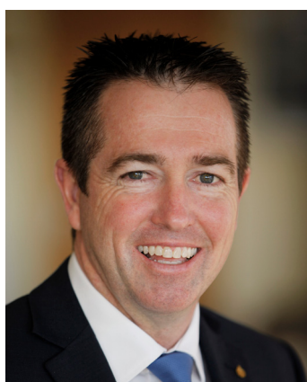
The Hon. Paul Toole, MP

Through the Newcastle Port Community Contribution Fund, the NSW Government is investing in a lasting legacy of projects to invigorate and revitalise the Newcastle harbour precinct.