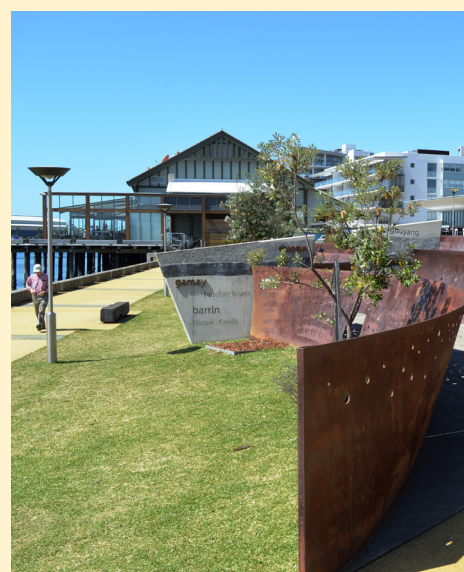
Top: Newcastle Breakwall is enjoyed by many. Bottom: Sculptures like this one feature throughout the Newcastle Foreshore area.