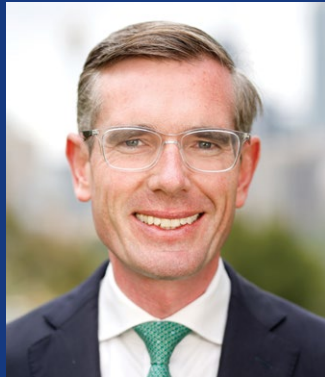
Dominic Perrottet Premier of NSW

When you look around NSW today, cranes dot the skyline as massive projects take shape before our eyes.