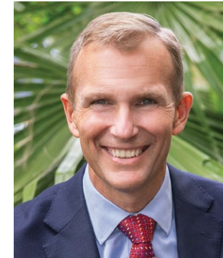
Rob Stokes Minister for Infrastructure, Cities and Active Transport

By building infrastructure we build opportunity. Our infrastructure pipeline provides jobs, skills development for young people and First Nations peoples, and allows more opportunity for women to access employment opportunities previously denied to them. The dividend of our work in providing new and renewed infrastructure is new public transport, safer roads, better school buildings, and enhanced access to health care. Building infrastructure is building our civilisation – museums, stadiums, galleries, theatres and libraries. And building infrastructure is building a freer and fairer society through more parks and public spaces.