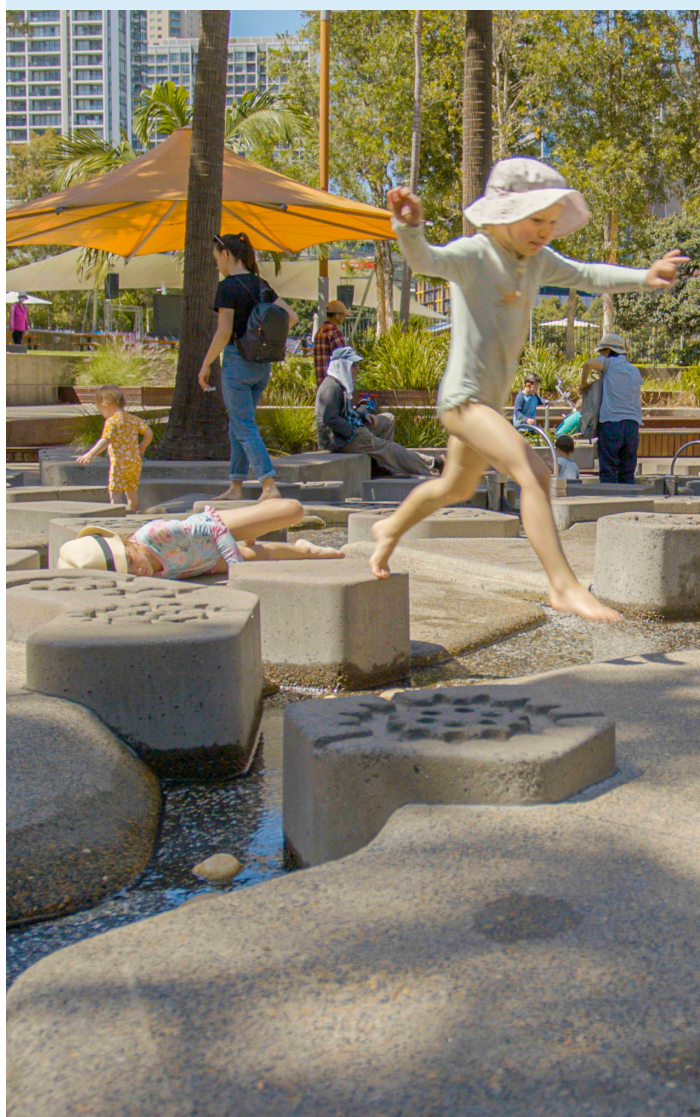
Tumalong Park - Destination NSW

Places to Play is about providing access to activities that have previously been considered extreme sports in public open spaces.