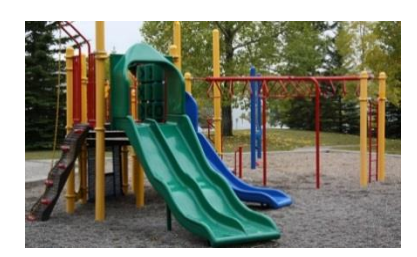
Play on the swing and the slide at the park.