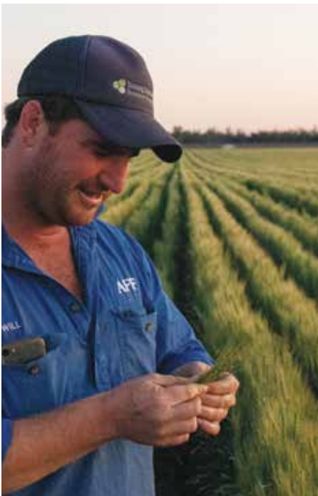
Cover: Orange picking in Moree Below: Farmer inspecting wheat in Moree Right: Boys leaning on a fence looking at sheep

Moree Plains Shire Council, together with the NSW Government, is developing a workforce attraction and retention strategy to position Moree Plains as a career and lifestyle destination and attract new workers and families to the community. For more information please contact council@mpsc.nsw.gov.au .