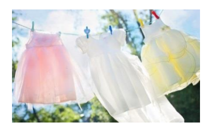
Sort the washing as it goes in the machine . This shirt is mine . Help me put in this towel.