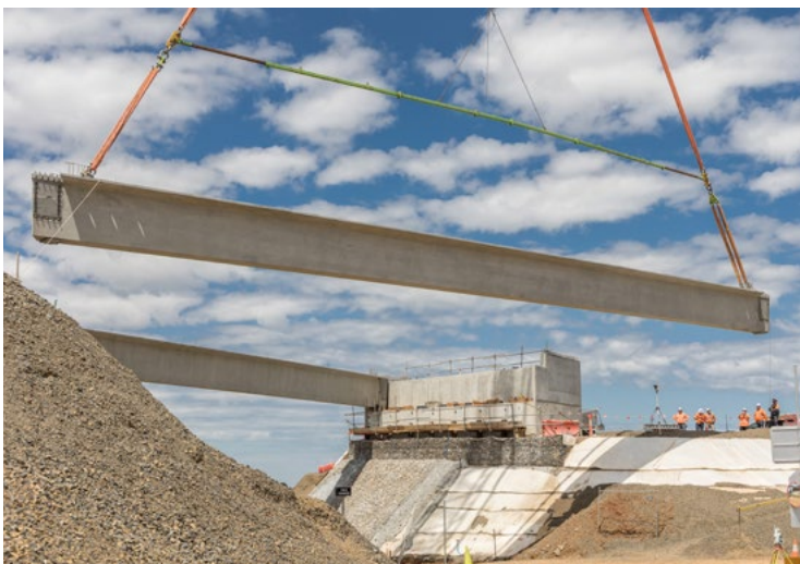
A concrete girder is hoisted into place on the new western bridge

Once open, the two new bridges will enable traffic to pass over the railway lines, meaning no more level-crossings. Given that there will be more traffic on these important freight pathways soon, these bridges will provide safer and more efficient passage along Brolgan Road.