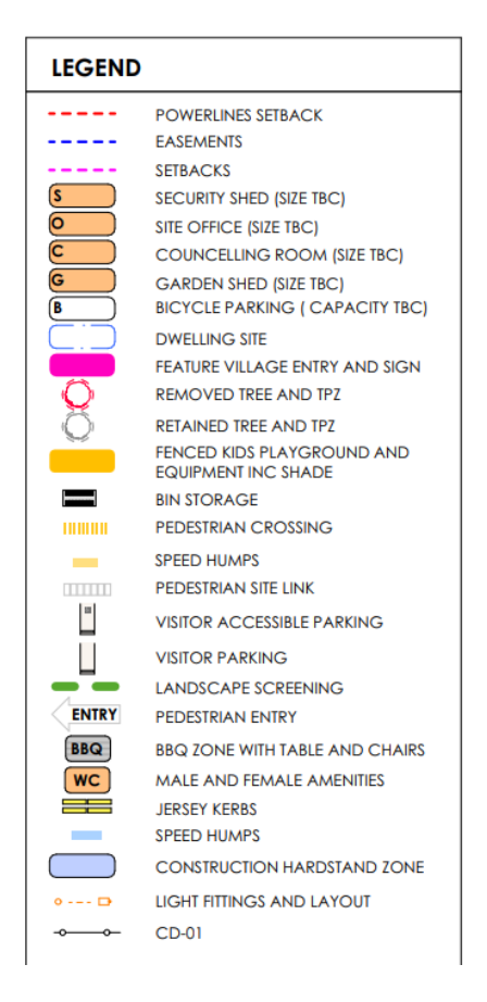
Legend for preliminary site layout. Preliminary site layout is indicative and may change during construction.