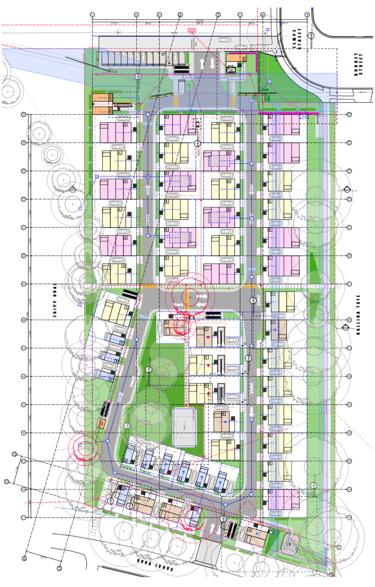
Preliminary site layout is indicative and may change during construction.