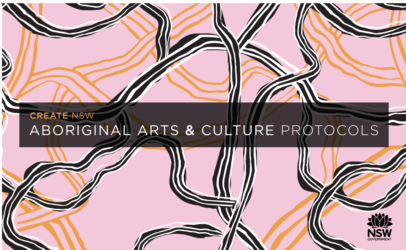
Cover of the Create NSW Aboriginal Arts & Culture Protocols featuring Warruwl by Lucy Simpson.