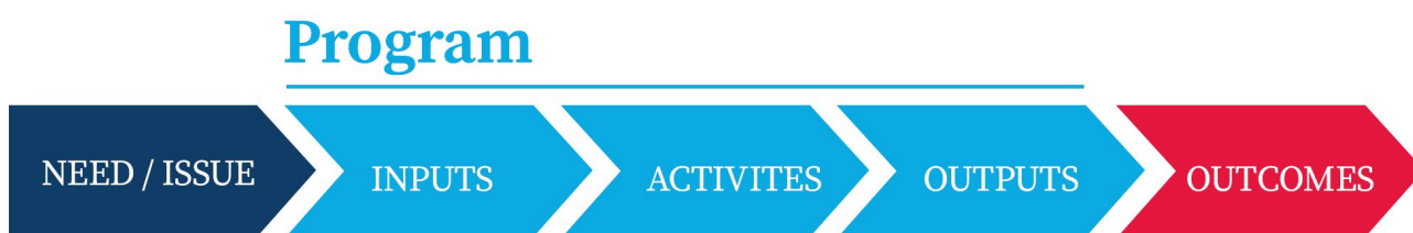
Fig 1.1. Program effectiveness is measured against outcomes wherever possible. Outcomes represent the highest level of result that is measured.