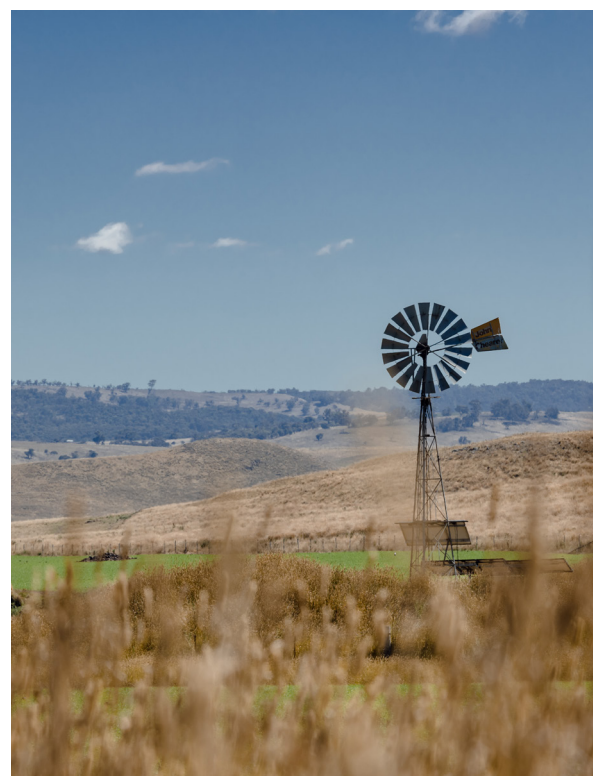
Snowy Mountains 2023, courtesy of DRNSW