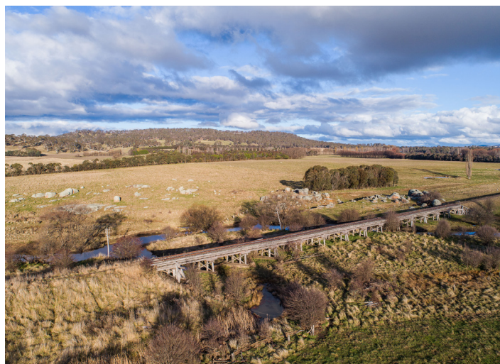
From left: Grenfell 2021. Glen Innes 2022.