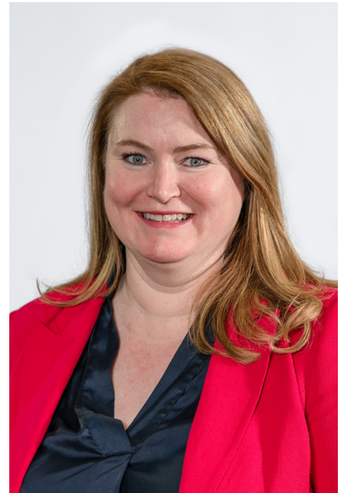
The Hon. Tara Moriarty, MLC MP