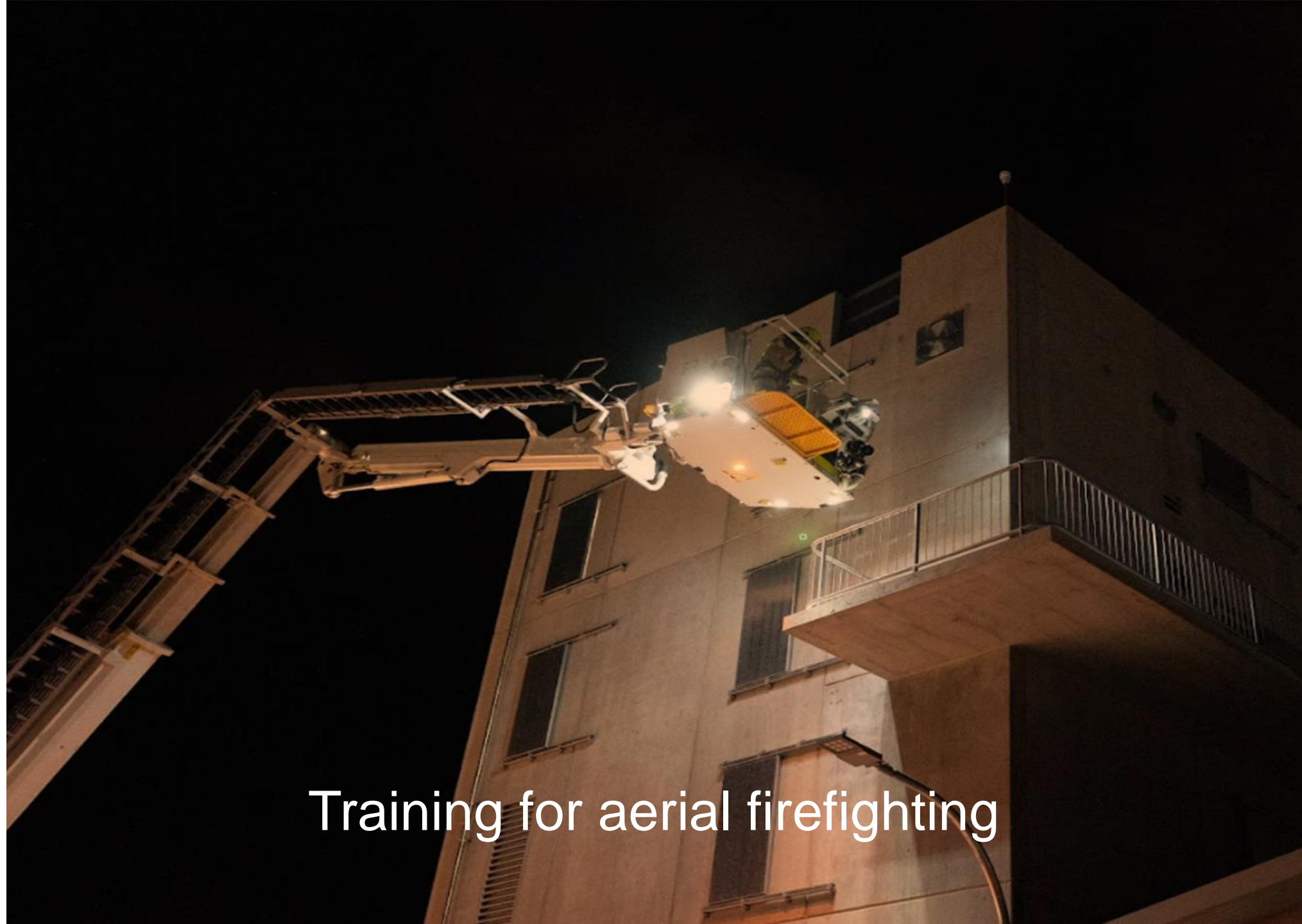
Training for aerial firefighting