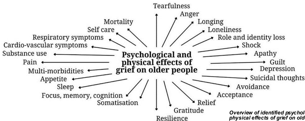
Overview of identified psychological and physical effects of grief on older people

Independent of age, the stress of bereavement can affect physical and mental health with the potential of compromising people's functioning for years