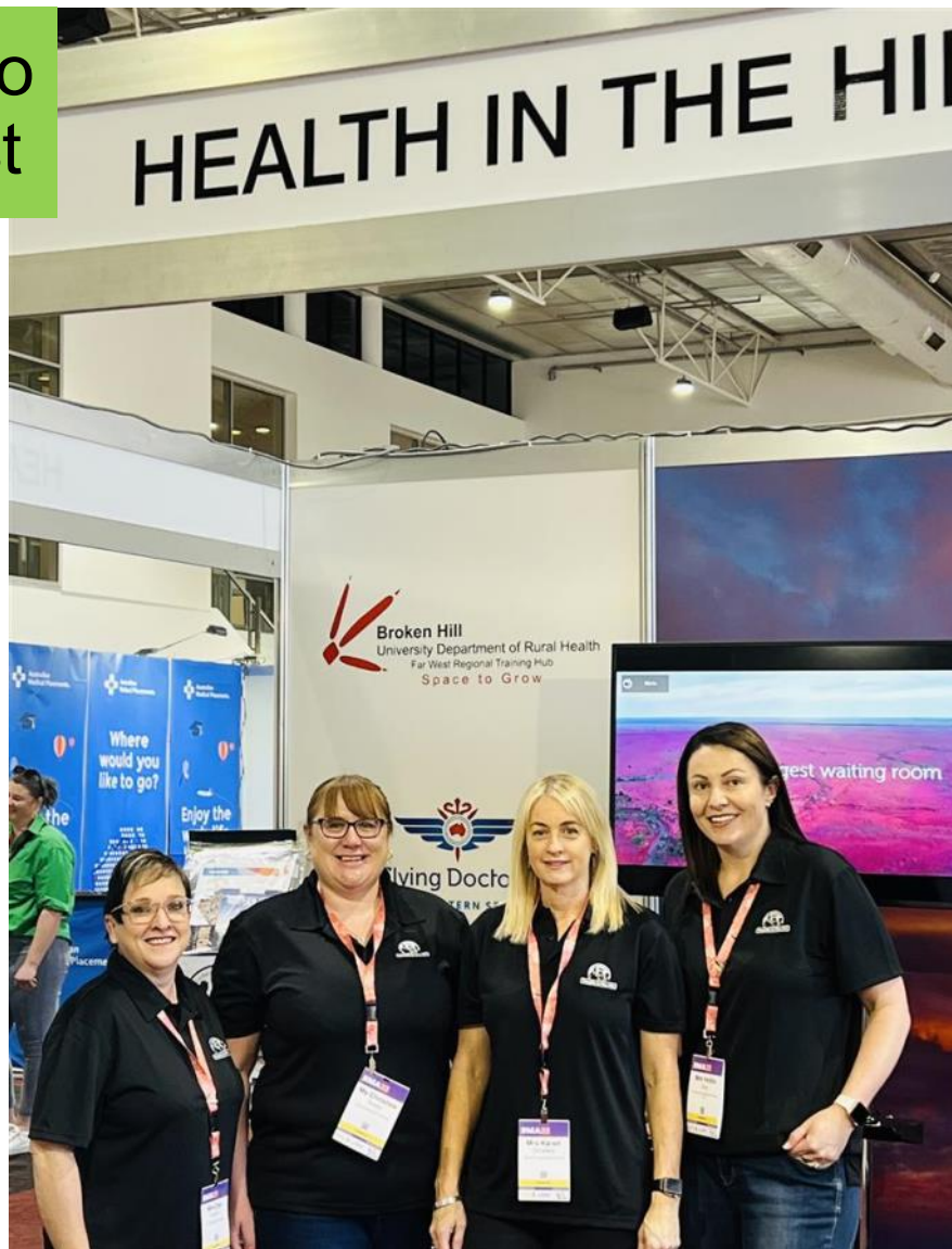
The Health in the Hill team at the RMA22 Conference in Canberra.