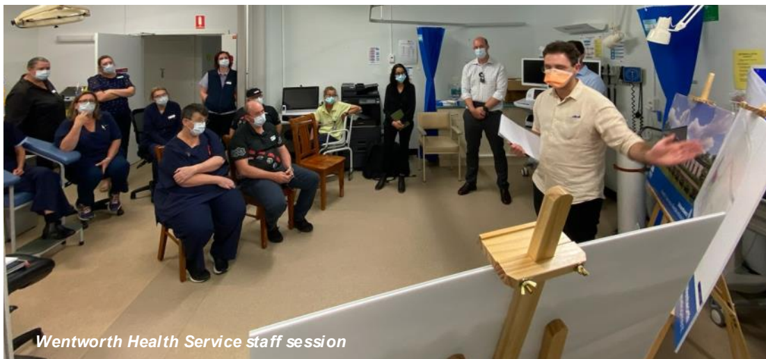
Wentworth Health Service staff session

The sessions followed consultation with Aboriginal Focus Groups held in October, where the landscaping aspect of the concept design was a key focus of discussion. Connection to Country and landscape is central to the design of the redevelopment, which will overlook the Darling River.