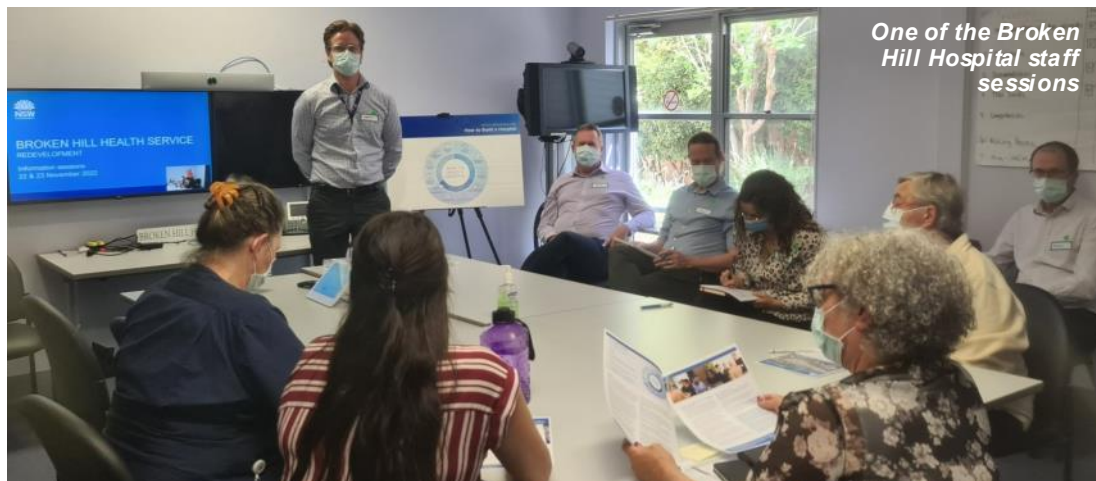
One of the Broken Hill Hospital staff sessions

HL- BrokenHillRedev@health.nsw.gov.au for the Broken Hill Health Service Redevelopment.