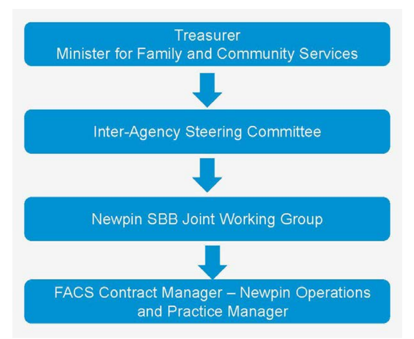
FIGURE 2 – THE NEWPIN SBB GOVERNANCE ARRANGEMENTS

A Joint Working Group comprising representatives from NSW Treasury, FACS and UnitingCare Burnside is responsible for oversighting and monitoring the Newpin SBB and providing a forum to discuss any issues relating to the effective integration of FACS and UnitingCare Burnside. This includes roles and responsibilities under the Implementation Agreement and other key issues including referrals, outcomes, payments, projections, operational issues, dispute resolution and the opening and closure of Newpin Centres.